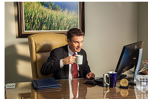
Thinking About Opening A Franchise? 2017 Is The Year For Business Startup Express Employment Professionals