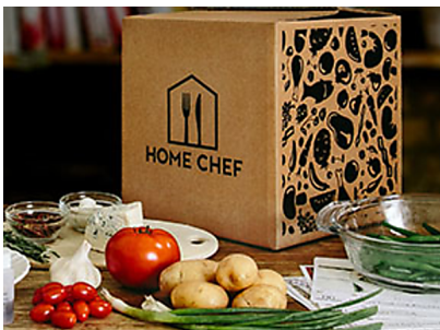
CBS News Reports Meal Service is Cheaper Than Grocery Store Home Chef