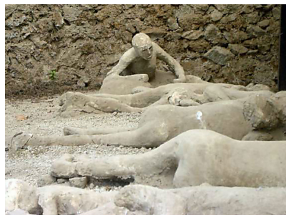
The Discovery Of The Century Left Archaeologist Jaw Dropped theProfessional.net