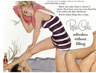
75 Vintage Ads That Are No Longer Socially Acceptable Frank151