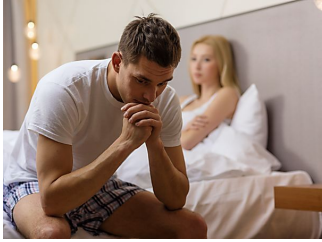
The One Thing All Cheaters Have In Common TruthFinder