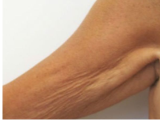
How to 'Fix' Crepey Skin Health Headlines