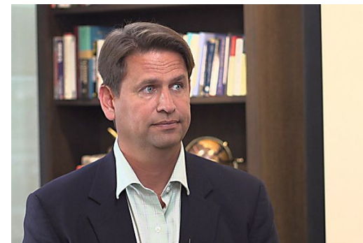
Reclusive Millionaire Predicting 'Cash Panic' In 2017 DailyWealth