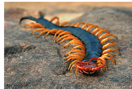
The Most Venomous Species In The World You Wish Were Extinct Frank151