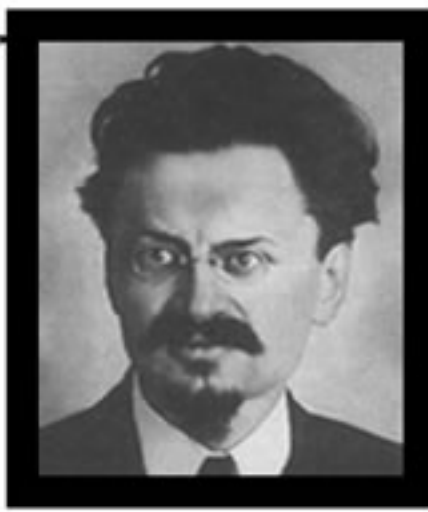
← Leon Trotsky ? Russian Communist