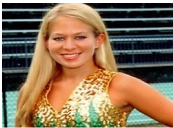
Teen Goes Missing in Aruba: 10 Years Later Police Uncover the Truth RightBrainNews