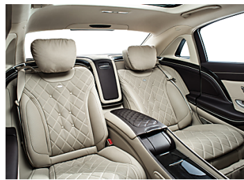
These SUVs are the Cream of the Crop Yahoo! Search